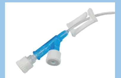
Dual Port with Dual End Caps