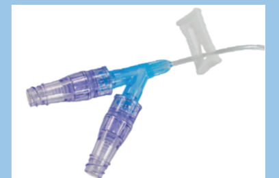
Dual Port with Dual Needleless Connector