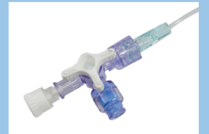
Single Port with Stopcock and Needleless Connector